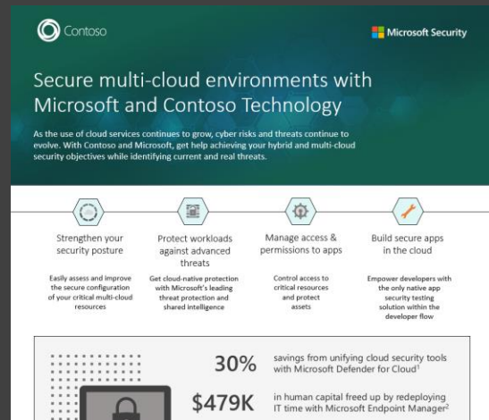
Example of the template that has been customized with brand colors