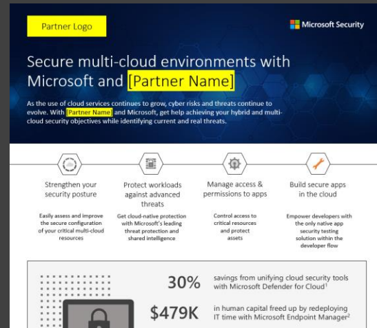
Template in original color scheme